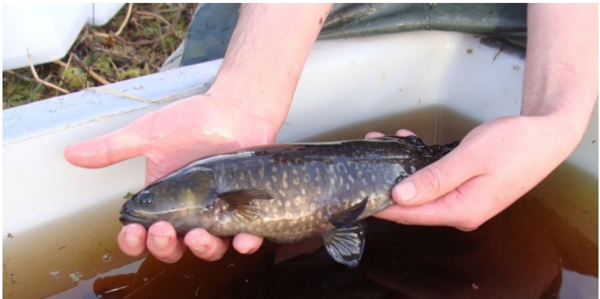
Giant kōkopu/taiwharu ( Galaxias argenteus )

Plant & Food Research joins forces with Māori groups to conserve taonga fish and plants